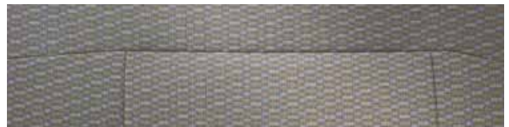
DX 4x4 Interior.